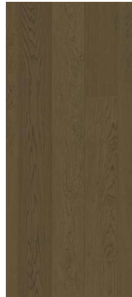
OULO7 | Wood: OAK | Base powder: RED/BROWN | Finish: DARK BROWN