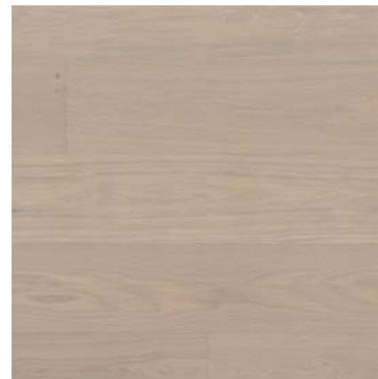
OULL3 | Wood: OAK | Base powder: NATURAL | Finish: WHITE