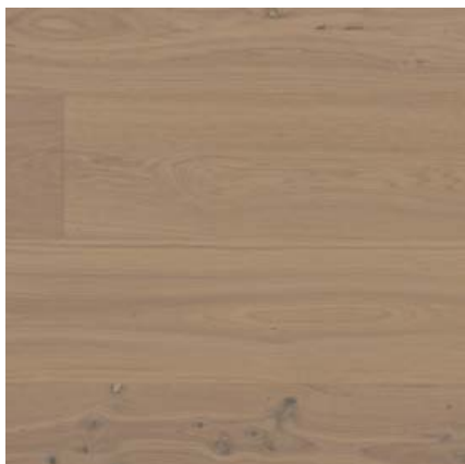
OULO4 | Wood: OAK | Base powder: NATURAL | Finish: GREY