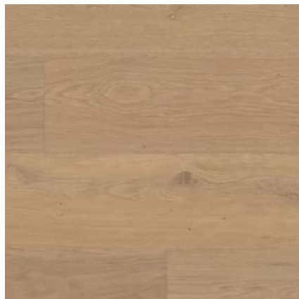
OULO2 | Wood: OAK | Base powder: NATURAL | Finish: RAW