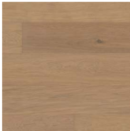
OULL2 | Wood: OAK | Base powder: NATURAL | Finish: RAW