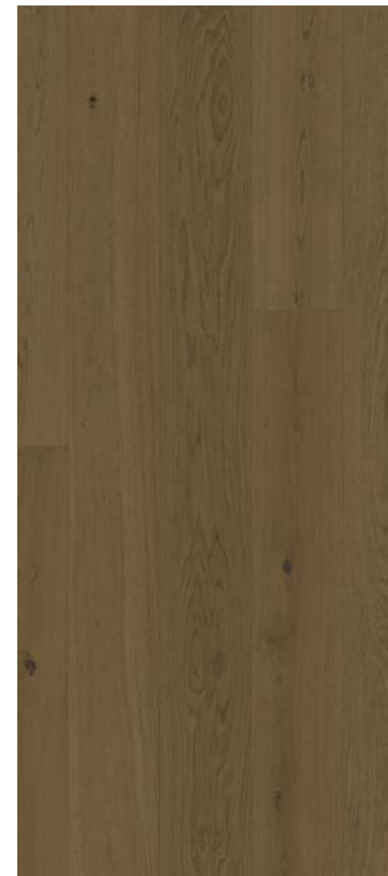
OULL7 | Wood: OAK | Base powder: RED/BROWN | Finish: DARK BROWN