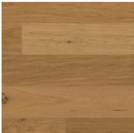
OULL1 | Wood: OAK | Base powder: NATURAL | Finish: NATURAL