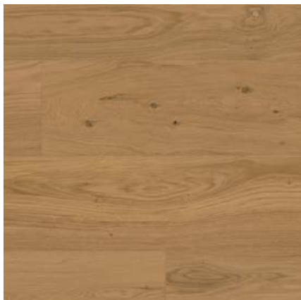
OULO1 | Wood: OAK | Base powder: NATURAL | Finish: NATURAL