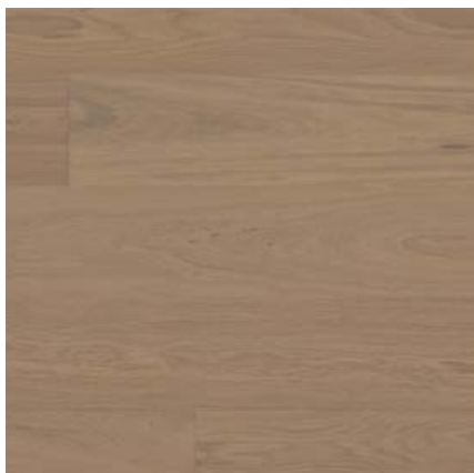
OULL4 | Wood: OAK | Base powder: NATURAL | Finish: GREY