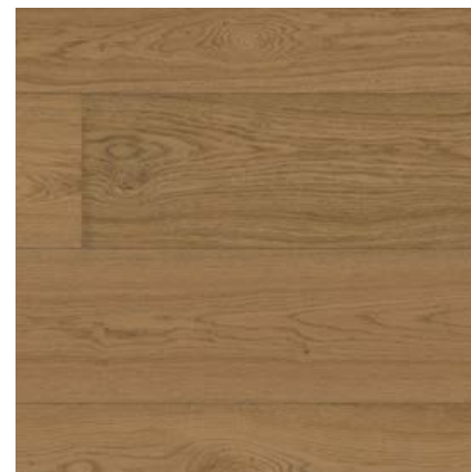
OULO6 | Wood: OAK | Base powder: RED/BROWN | Finish: BROWN