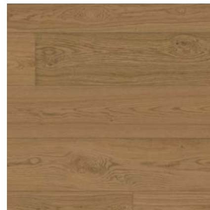
OULL6 | Wood: OAK | Base powder: RED/BROWN | Finish: BROWN