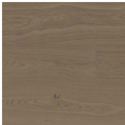
OULL5 | Wood: OAK | Base powder: NATURAL | Finish: DARK GREY