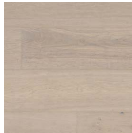
OULO3 | Wood: OAK | Base powder: NATURAL | Finish: WHITE