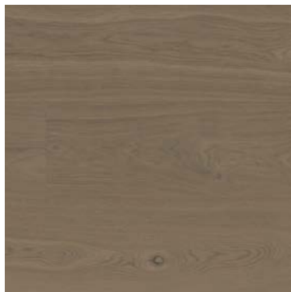
OULO5 | Wood: OAK | Base powder: NATURAL | Finish: DARK GREY